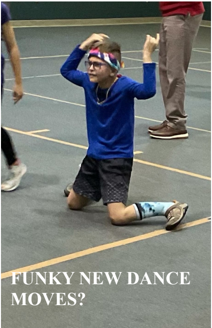
FUNKY NEW DANCE MOVES?

Dear Church Family, I marvel at how God continues to weave our individual stories into a beautiful narrative of love, uniting us in His Spirit to make Christ known in our community and across the world. Because of your generous love, the Stewardship Committee wants to thank each of you for pledging financial support during the 2023 Fall Covenant Campaign. Making a future pledge during this challenging economy is not only an act of faith, but also demonstrates true worship of God with thanksgiving and through sincere prayer. No human effort could have unleashed such generosity! We believe as Elijah had done, and God brought forth the rain (James 5:17-18). We are witnessing firsthand, that the fervent prayer of the righteous is powerful and effective (5:16). Again, many thanks for your faithfulness and fidelity to the mission and ministry of The Church of the Covenant. And if there are those who have yet to pledge, it's not too late. For God loves a cheerful, merry, joyous, and hilarious giver (2 Corinthians 9:7).