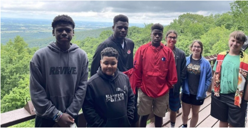
The Teen Extreme group about to tour Laurel Caverns on a field trip.

Teen Extreme started on June 7th. We have a fantastic group of 8 teens attending. Our theme for the summer is “Never Give Up.” Field trips include Laurel Caverns, The Gateway Clipper and Hershey Park. We will volunteer at the Washington Outreach and will be working on props and decor for VBS. We are having a great time learning how to be resilient all while making new friends.